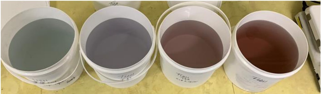
Figure 1: Progressive extraction of copper from Pregnant Leach Solution (PLS) (PLS in bucket second from left showed maximum copper extraction with minimum cobalt loss)