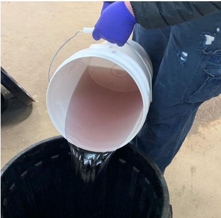
Figure 2: Co-Ni PLS (feed stock for Cu-Ni precipitation pilot plant)