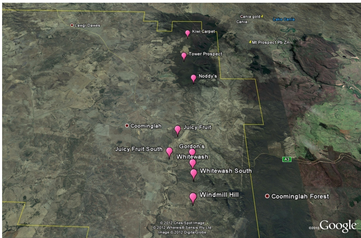
Figure 1 Below: Shows an overview of the location of Kiwi Carpet and the other mineralised zones along strike and within the Greater Whitewash area.